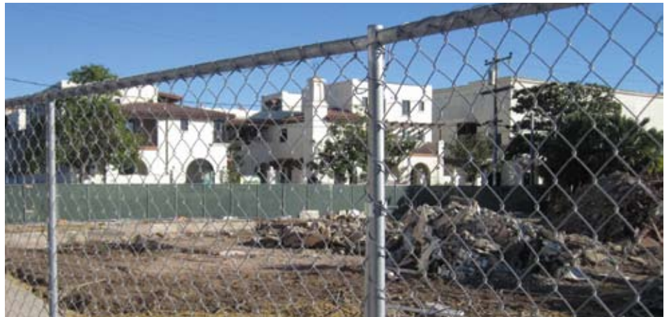
A view of demolition from the back parking lot next to TH's administrative offices. The shot shows the Housing Authority's newest project across Cota Street, Artisan Court, serving downtown workers, homeless individuals and young adults aging out of foster care.

The groundbreaking ceremony was conducted in true Transition House style. Most groundbreakings involve