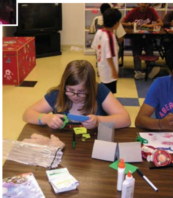
With the help of staff and volunteers, T-House kids learn and create during our Evening Enrichment Program.

T-House outings promote education while providing some fun. Staff and kids visited the Santa Barbara Farmers' Market to learn about local farms and healthy eating. The trip was followed by a cooking project using the foods purchased at the market.