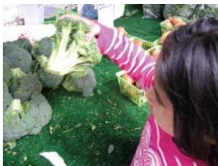
We're learning to LOVE broccoli...sort of!

T-House outings promote education while providing some fun. Staff and kids visited the Santa Barbara Farmers' Market to learn about local farms and healthy eating. The trip was followed by a cooking project using the foods purchased at the market.