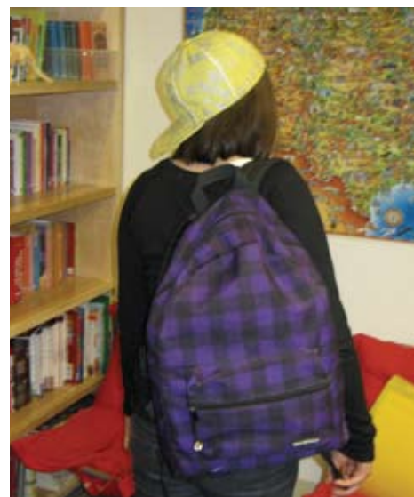
This shy teen loves her new backpack!

Each year, the Transition House Auxiliary provides brand-new backpacks filled with school supplies for children entering the shelter. T-House families usually do not have the resources to outfit kids for back-to-school. Thanks to the Auxiliary, our school-aged residents had all the tools their housed peers had on the first day of school. ⬆