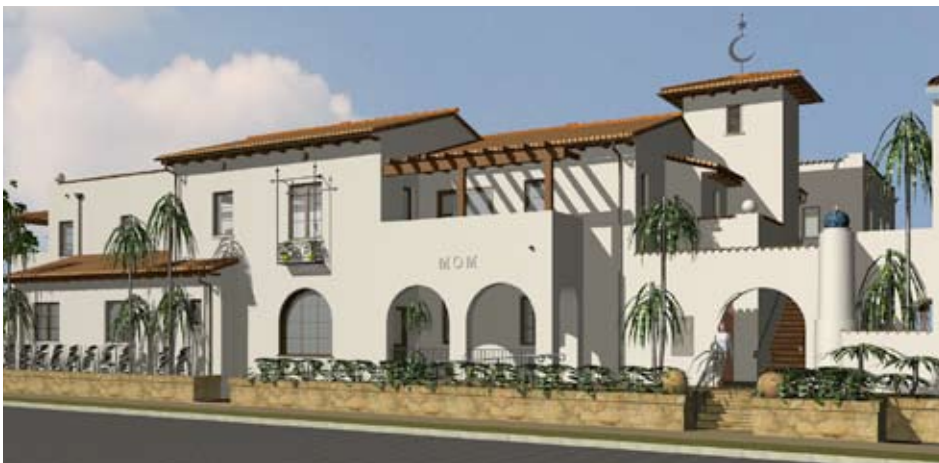
The Mom's Project will be located at 421 E. Cota Street. We decided to keep the name used by the restaurant that existed at the location for many years. It seems fitting for a daycare center and housing that will support families to be called "Mom's."